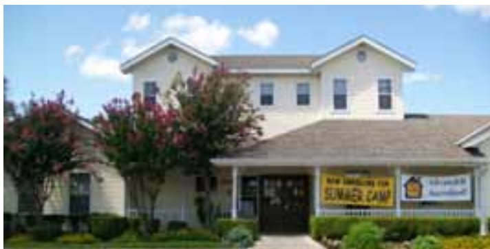
Country Home Learning Center, Live Oak

Children grow as individuals as they journey throughout the different developmental, social, and academic stages of life. Country Home's most important objective is to provide students with many opportunities to succeed every day. Frequent successes in young children promote self-confidence and a higher self-esteem, which are vital to the learning process. Country Home Learning Center is located at 11909 Toepperwein Rd. and can be reached at 210.650-3115 or visit their website @ country-homelearningcenter.com