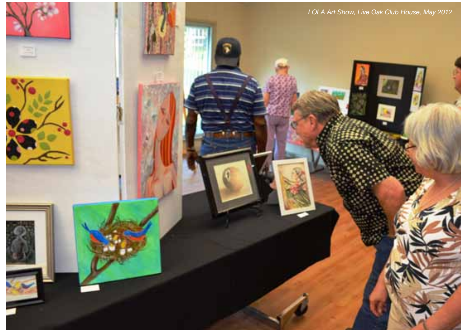
LOLA Art Show, Live Oak Club House, May 2012